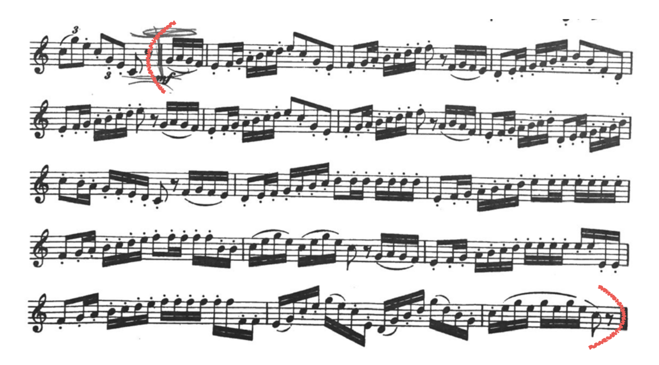
Excerpt 2 Concone, Etude No. 17 quarter note = 76-84